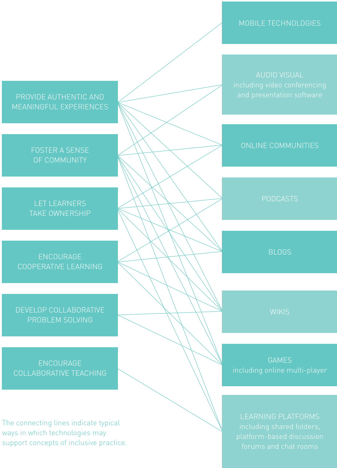
DIAGRAM 1: EXAMPLES OF HOW TECHNOLOGIES MAY SUPPORT INCLUSIVE PRACTICE CONCEPTS HIGHLIGHTED IN SECTION 2

Section 5 (the directory) has details on where to go to find out more about using these technologies.