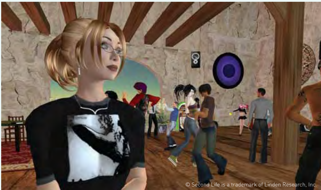
© Second Life is a trademark of Linden Research, Inc.

Second Life has a list of resources including an education mailing list, which gives teachers an opportunity to share information. There is also a Second Life Education Wiki: www.simteach.com/wiki/index.php?title=Second_Life_Education_Wiki .